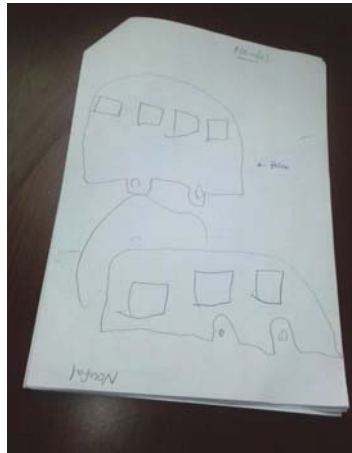
Figure 4: Pictures of police cars represent the child's (5 year-old) identity of wanting to become a police officer.

Brooks (2003) states that drawing is a unique mental tool for young children through which they form interpersonal and intrapersonal dialogue.