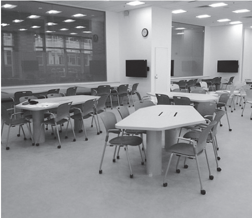
FIGURE 1. Classroom at Hong Kong University's Centennial Campus

affairs offers new skills for responding to the challenges facing China today.