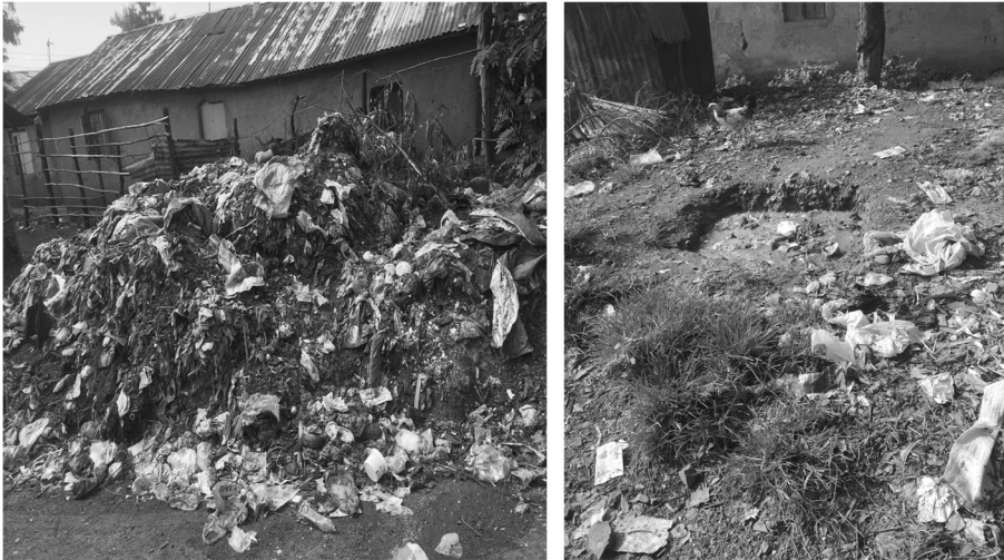
Fig. 3 Uncollected waste in Nyalenda and organic waste disposal in a compost pit

their solid waste in ungazetted spaces, along roadsides, in drainage channels and open spaces, mostly at night when they are not seen. Kachok dumpsite is situated approximately 2 km from Kisumu CBD, in close proximity to Nyalenda residential estate, Moi Stadium and Mega City shopping mall (Nyaluogo 2016). It has a manned gate at which those disposing their wastes at the site are supposed to pay KSh 100 (Liyala 2011). The fee is meant to help raise revenue for managing the site. However, the situation at the site indicates that it is inadequate for the intended purposes or the collection, and expenditure mechanisms are not as efficient. The dumpsite is fenced with iron sheets but they occasionally fall out of place leaving the site exposed and accessible to scavenging animals and informal waste pickers (NEMA 2015). In this state, its boundaries remain unsecured resulting in litter spilling onto nearby stadium grounds, public footpaths, roads and private properties. The 3-acre dumpsite caters for waste from all waste-generating sectors including residential, commercial, industrial and healthcare facilities.