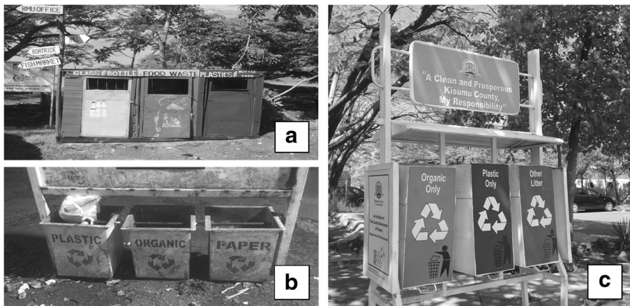
Fig. 2 The three-bin system in Kisumu CBD and Dunga Beach (image taken by Lesley Sibanda). a Waste collection and segregation bins at Dunga Beach. b , c Different labelling of segregation bins by the Kisumu City Department of Environment

adequate financial resources to purchase new equipment and maintain the existing ones in excellent working order (Liyala 2011; Magezi 2015).