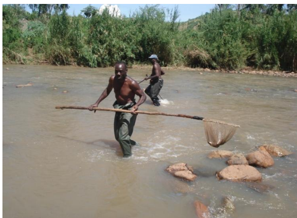
Figure 4. Bringing the catch ashore.