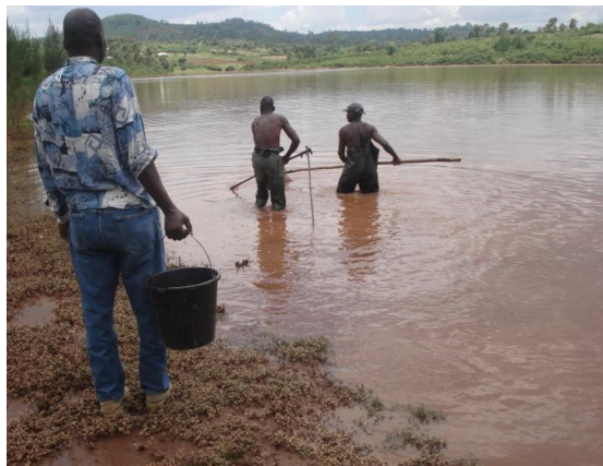
Figure 3. Electrofishing in progress in the pond area (the newly created artificial lake).