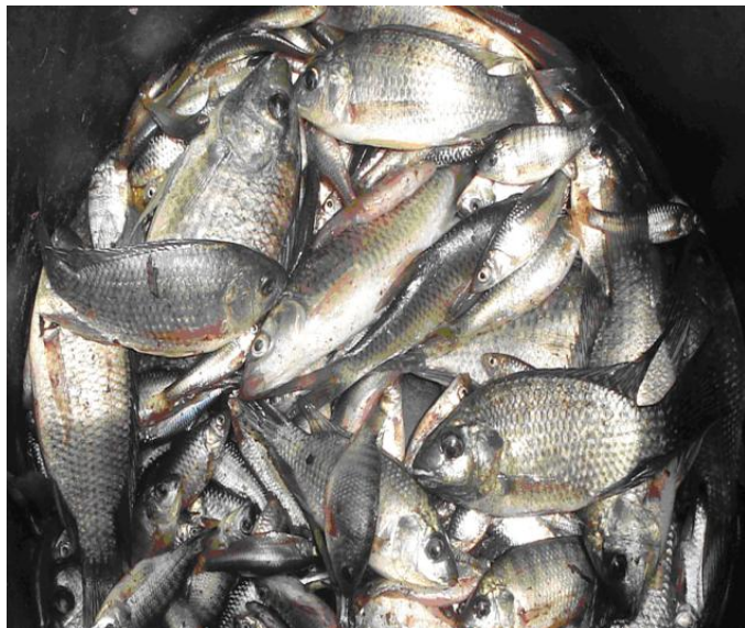
Figure 5. Different sizes of tilapia fish caught by beach seining at the newly created artificial Apoko Lake of the Sondu-Miriu River.

this part of the river (UZ and DZ) has no fish. The community seems ignorant of the present and abundant fish in this part of the river. It is noted, also, that in spite of the newly created and promising fisheries that has, apparently occur due to the creation of a new lake in the area (Lake Apoko/ the Apoko Pond area in the Upper Zone), there are already uncontrolled and destructive irresponsible methods of fish harvesting going on in the area (Figure 5).