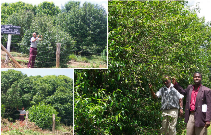
Fig. 1 Tea plants left to grow in a seed barie

claimed that tea beverages are the most widely consumed fluids after water (Agarwal 1989; Sharma et al. 2007). World tea production has grown rapidly, causing over supply of the commodity, resulting in stagnation or reduction in prices (Anon 2008). As a result tea growers strive to improve productivity and profits through optimising agronomic in-puts and cultural practices to realise highest production per unit area and best quality at the lowest cost of production. Tea yields are controlled by yield components which include; harvestable shoot size, number of shoots per unit area and rate of shoot growth (Odhiambo 1989; Mathews and Stephens 1998a). The expressions of these components are controlled by environments, management practices and the genotype. Similarly, black tea quality is influenced by agronomic in puts (Ravichandran 2004) and cultural practices (Cloughley 1983; Owuor and Othieno 1991).