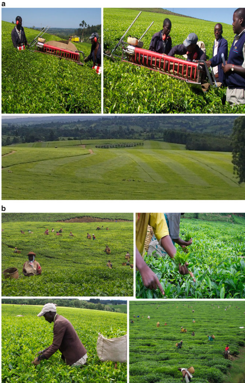
Fig. 3 (a) A method of mechanical tea harvesting. (b) Hand plucking of tea