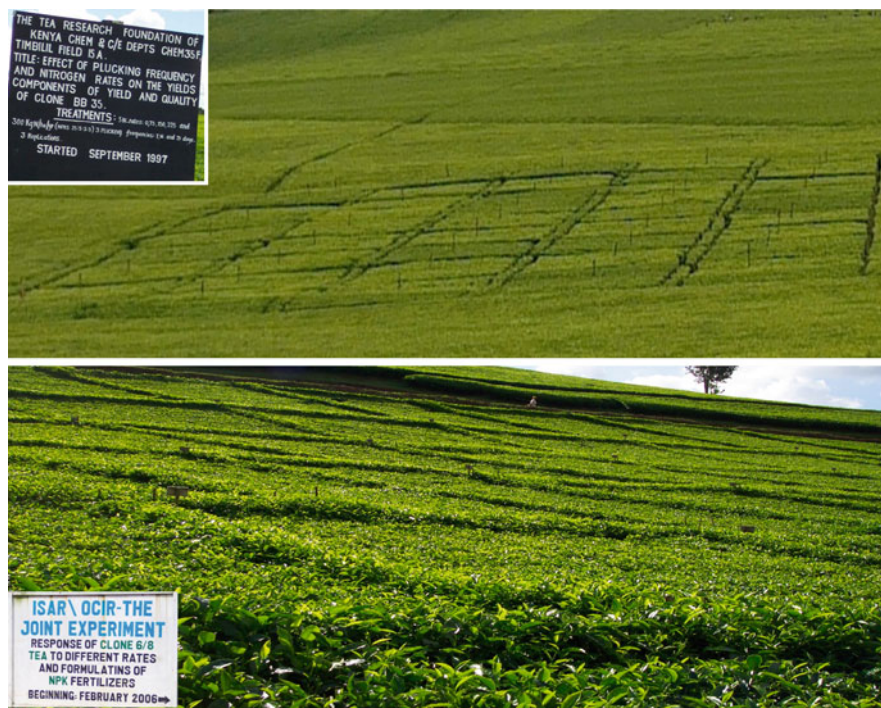
Fig. 4 Typical fertiliser field trials

Although fertilizer is one of most expensive agronomic inputs in tea plantations (Bonheure and Willson 1992), it is essential for economic tea production. Fertilizers increase yields (Bonheure and Willson 1992; Kamau et al. 2008a; Owuor et al. 2008b; Venkatesan et al. 2003, 2004) through increased growth rate and density of harvested shoots (Odhiambo 1989) (Fig. 4). The recommended agro-inputs and management on tea such as rates of nitrogen fertilizer in the eastern Africa region are widely adopted from Kenya (Anon 2002). But in practice, the rates, and sources vary from country to country (Bonheure and Willson 1992) and the popular formulation is NPK 25:5:5 or NPK 20:10:10 (Bonheure and Willson 1992). In recent years, there