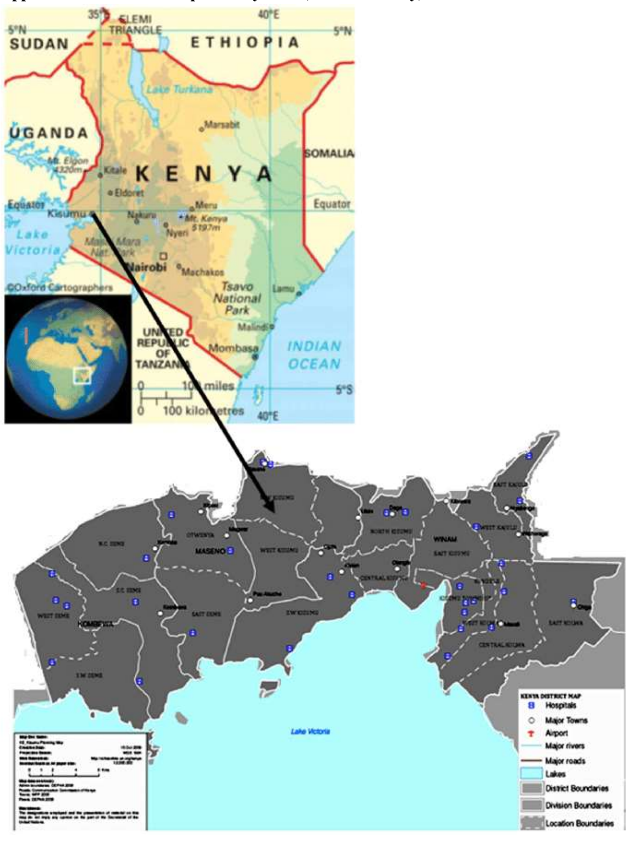
Appendix III: Research Map of Study Area (Kisumu County)