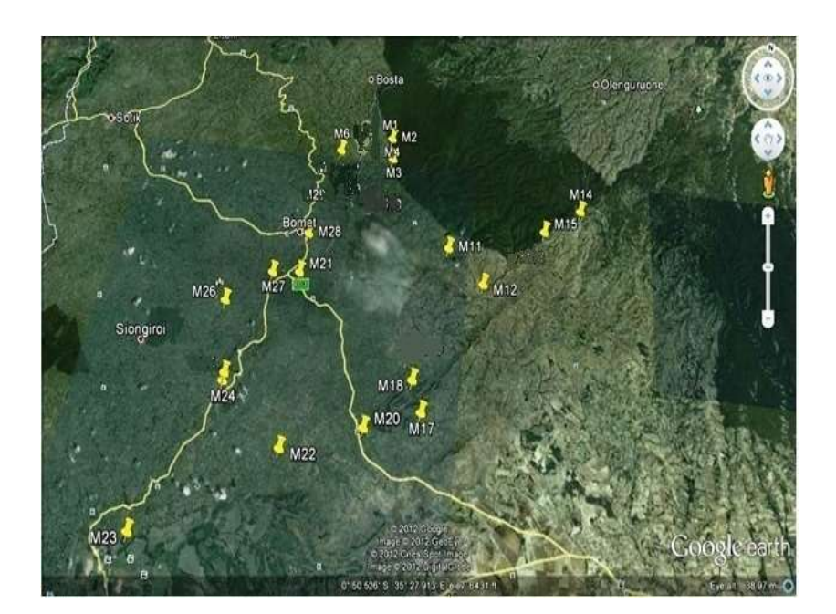
Figure 2. A Google earth map of Mara River Basin and sampling points.

1° 03' south and between longitudes 35° 01' and 35° 33' east (Figures 1 and 2). The area was heavily forested (UNEP, 2006, 2009) with typical equatorial natural forest trees, but parts have been converted to large and small scale farming and a buffer zone