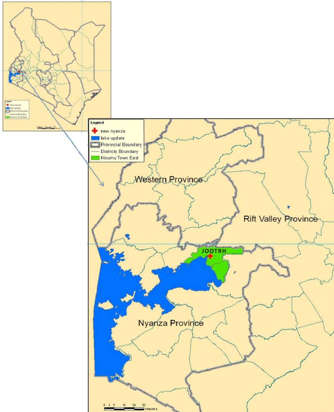
Appendix 1: Map of study area